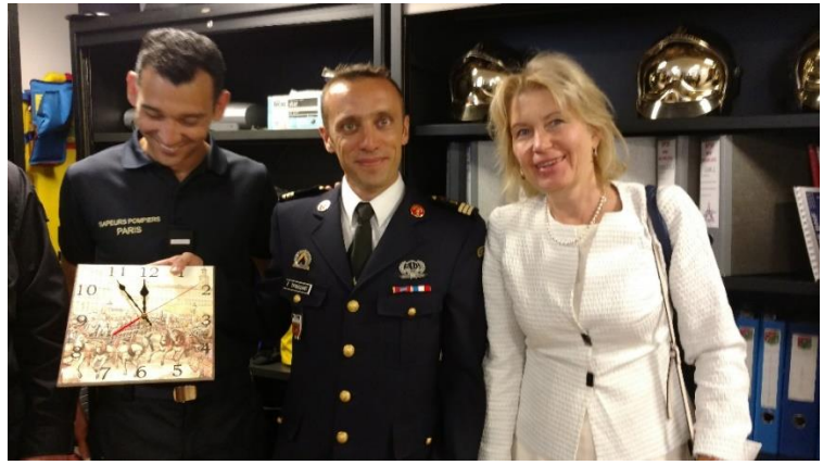
Figure 2: Visit at London Fire Brigade

In the afternoon we visited the Bibliothèque Nationale de France, the National Library of France, located in Paris. It is the national repository of all that is published in France.